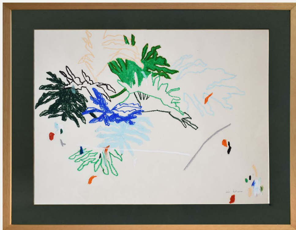
ETUDE DE L'ORGANIQUE STUDY OF THE ORGANIC