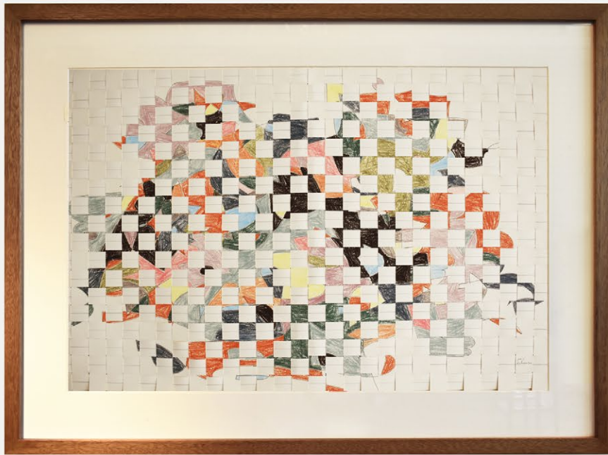
ETUDE D'UNE DISCTINCTION STUDY OF A DISCTINCTION