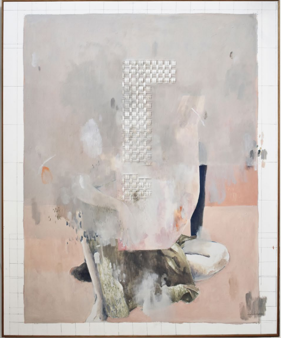
ARTIST'S NAME TITLE MATERIALS DATE