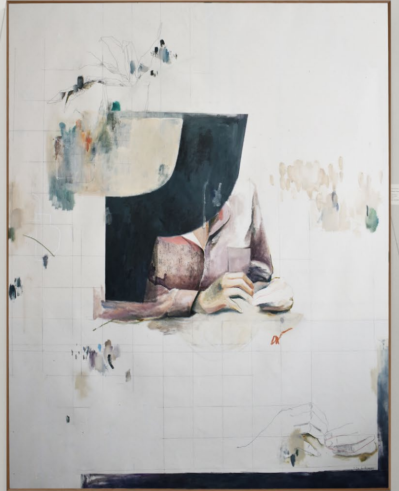
ARTIST'S NAME TITLE MATERIALS YEAR