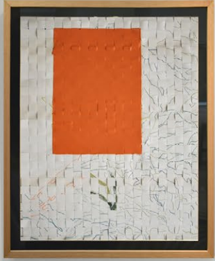
ARTIST'S NAME TITLE MATERIALS YEAR