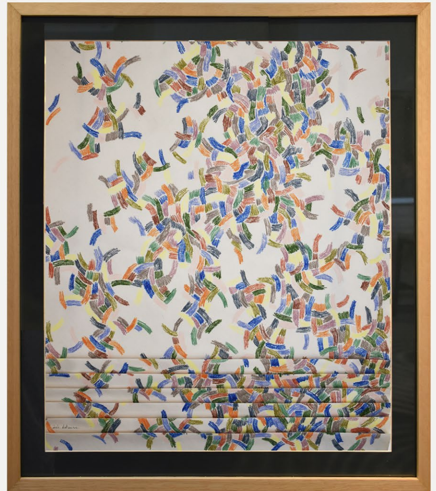
ETUDE DE L'INHIBITION INHIBITION STUDY