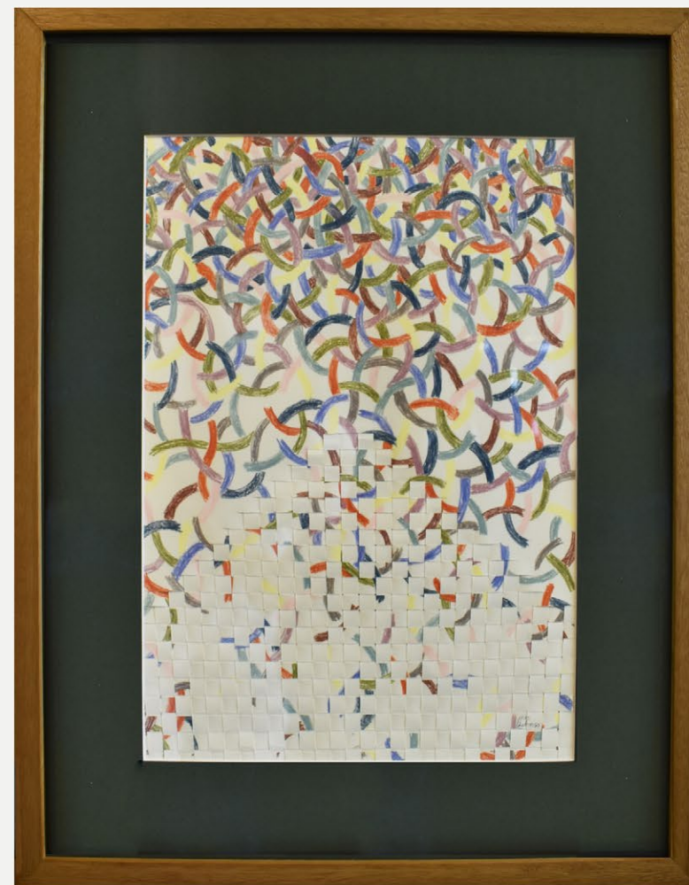
ETUDE DE LA TIMIDITE STUDY OF SHYNESS