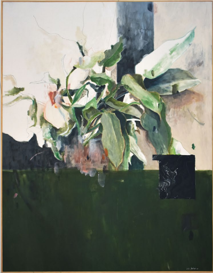
ARTIST'S NAME TITLE MATERIALS YEAR