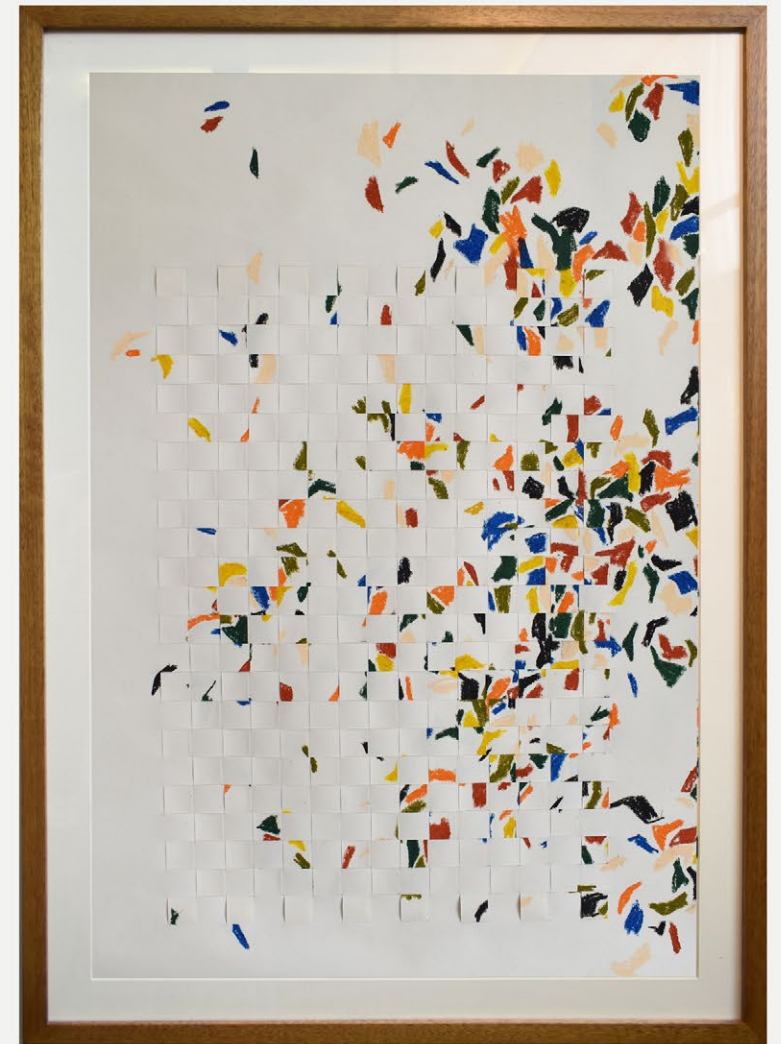
ETUDE D'UNE FOCALISATION INTERNE STUDY OF AN INTERNAL FOCUS

colour pencil + acrylic and weaving on paper