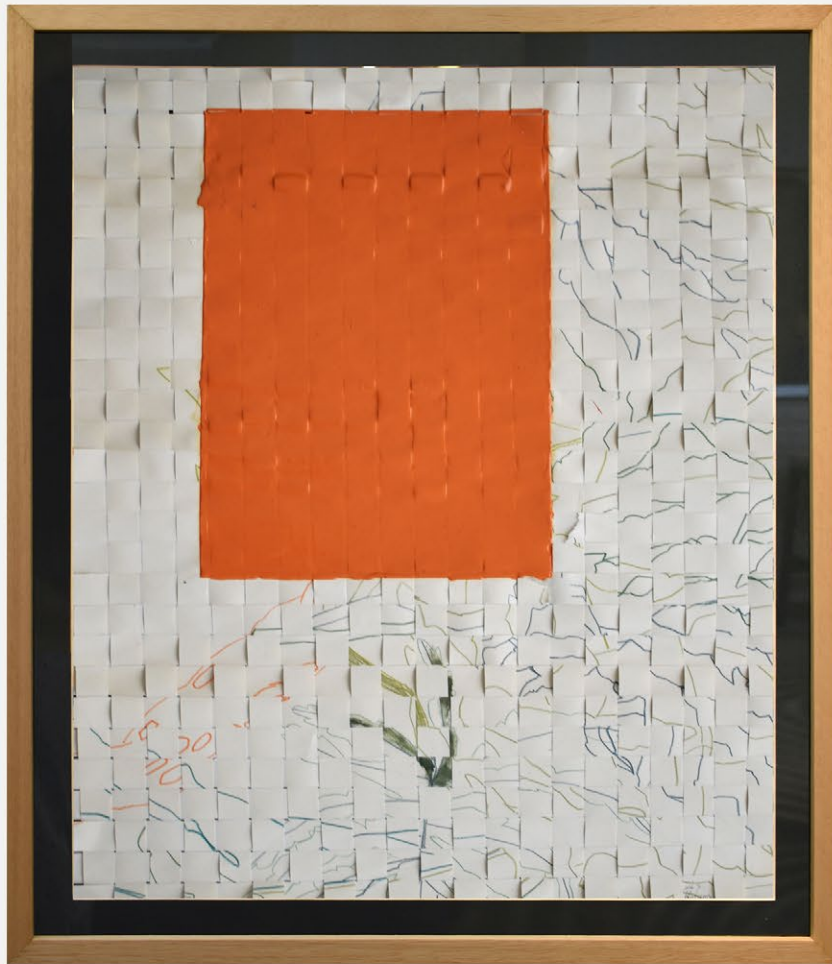
ETUDE D'UN AGGLOMERAT STUDY OF AN AGGLOMERATE